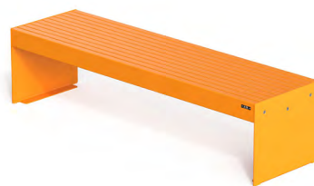
LENA - PM

Bench with backrest and armrest or without backrest, composed of two 5mm-thick steel sheet supports, with seat made of 40x20x1.5 mm (top) and 40x100x2 mm (side) steel tubes, with 3 mm thick steel sheet connection brackets.